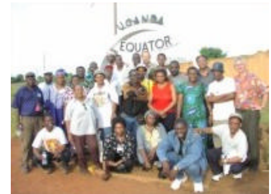
Group photo with most of the NECOFA country group: coordinators taken at a NECOFA Workshop in Uganda in 2002